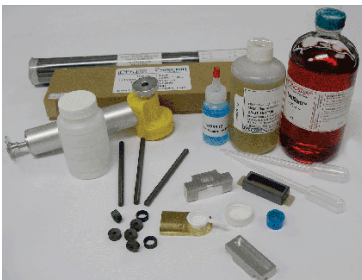
Oil Analysis Consumables